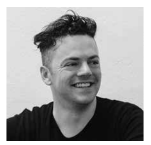
Nico Muhly Born in Randolph, Vermont, August 26, 1981 Now living in New York City

Nico Muhly's ascent to prominence among his generation of composers comes from music that has entranced listeners with its seductive blend of American Minimalism (he counts Philip Glass among his mentors) and rich contrapuntal textures redolent of Anglican choral music. Two albums released during the composer's 20s, Speaks Volumes (2007) and Mothertongue (2008), demonstrate, as well, an instinct for expressive immediacy that have made Muhly highly sought-after as both a pop music collaborator and film composer. His skills as a dramatic composer have garnered two commissions from the Metropolitan Opera: Two Boys (2011) and Marnie (2017).