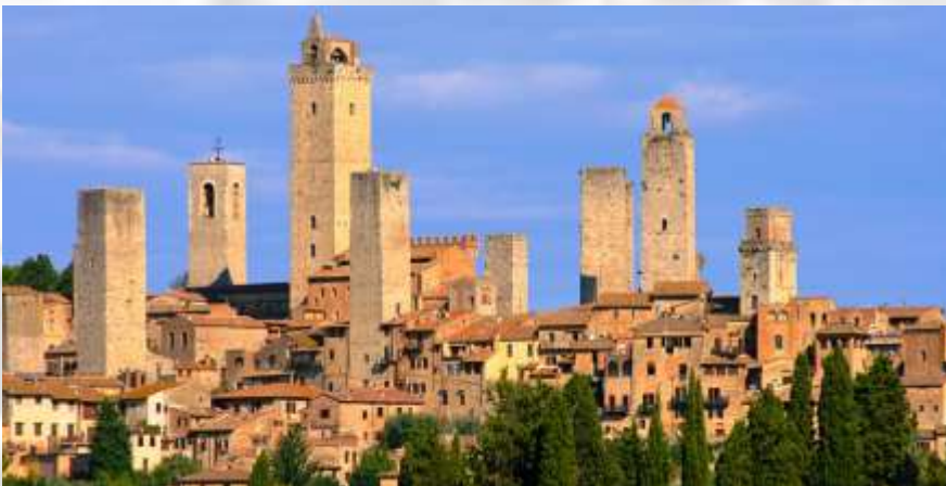
S. Gimignano ( Tuscany)

The historic centre of Siena has been declared by UNESCO a World Heritage Site. It is one of the nation's most visited tourist attractions. Siena is famous for its cuisine, art, museums, medieval cityscape and the Palio , a horse race held twice a year, in Piazza del Campo with la Torre del Mangia