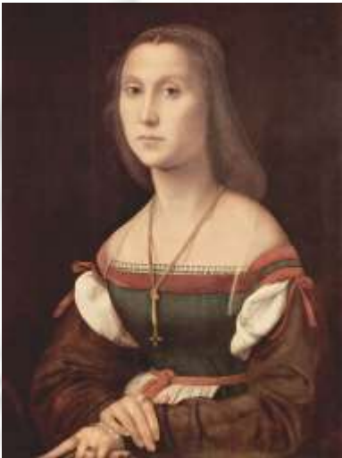
Raffaello "La Muta"

The Galleria Nazionale delle Marche (National Gallery of the Marche), housed in the palace, is one of the most important collections of Renaissance art in the world. It includes important works by artists such as Raffaello, Van Wassenhove (a Last Supper with portraits of the Montefeltro family and the court), Melozzo da Forlì, Piero della Francesca (with the famous Flagellation ), Paolo Uccello, Timoteo Viti, and other 15th century artists, as well as a late Resurrection by Titian.