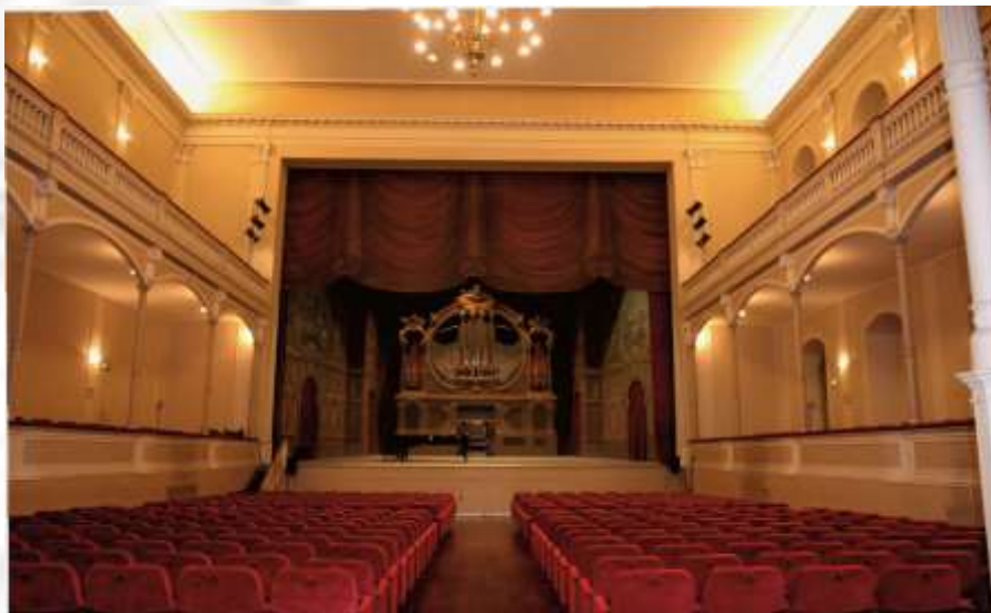
Auditorium Pedrotti -- Place of Rossini Opera Festival

9 pm Final Concert in Conservatory of Pesaro , Auditorium Pedrotti