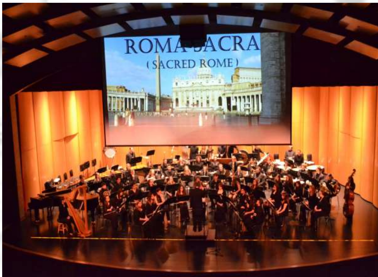
IWE International Wind Ensemble - Wisconsin April 2014