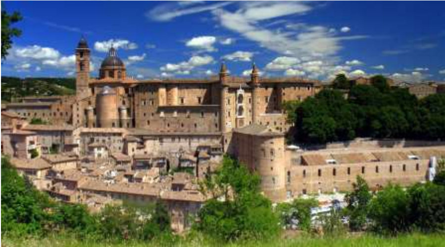
Urbino Palazzo Ducale

http://www.palazzoducaleurbino.it/palazzoducale.html