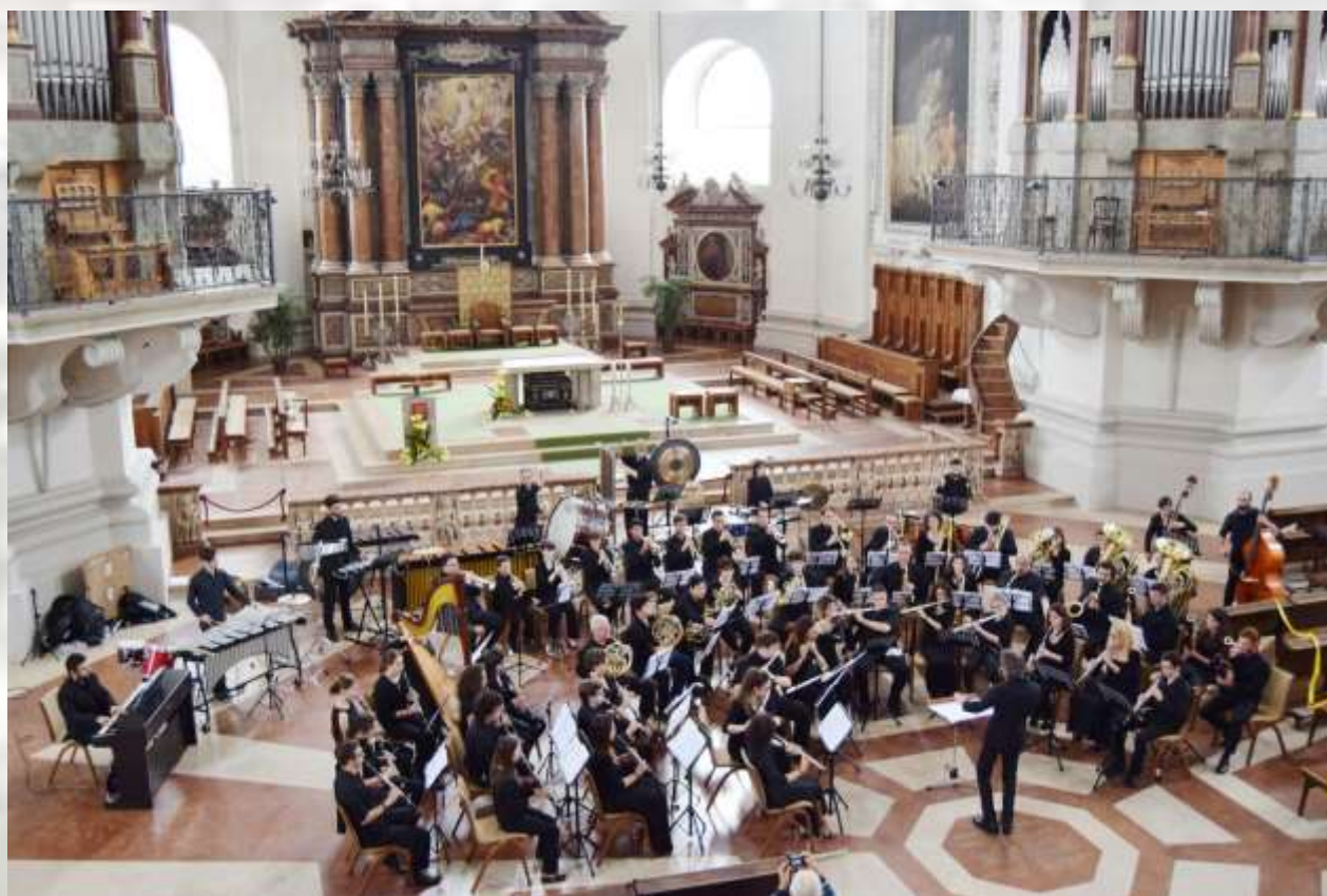
IWE - Basilika Salisburgo July 201