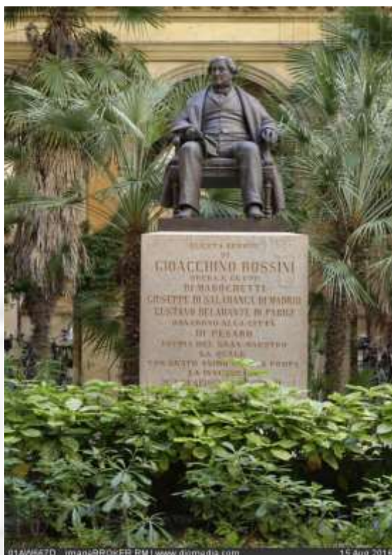
Gioachino Rossini, Conservatory of Music in Pesaro