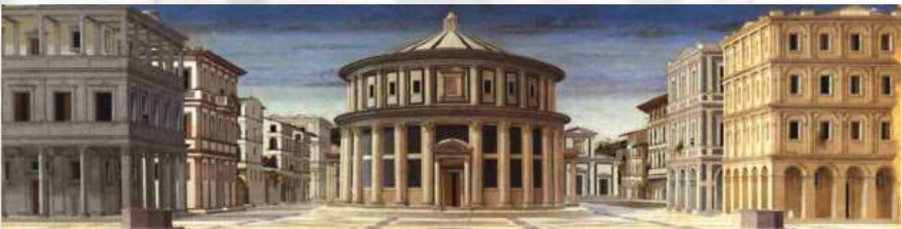
Piero Della Francesca "La città ideale"